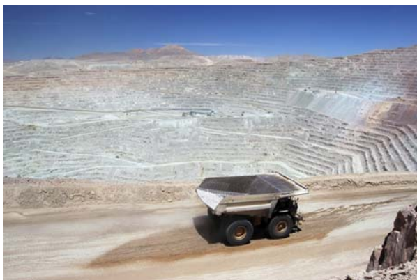
Ores are extracted at vast open-pit mines.

A company in the province of El Loa produces copper by leaching oxide and sulfide ores extracted at its open-pit mining complex. In copper leaching, thousands of tons of ore are placed in long rows called “leach pads” and sprayed continually with sulfuric acid. Copper is recovered from this process. More than 120 individual Opto 22 automation systems are part of the overall system that monitors and controls the precise delivery of sulfuric acid to each leach pad. The Opto 22 systems monitor pressure in the pipes transporting sulfuric acid. Pipe pressure data is then sent to an Allen-