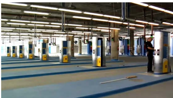
The Sanchinarro Depot

Designed and constructed by the HAM Group, a Spanish company specializing in gas installation projects, the Sanchinarro station includes numerous subsystems and a variety of fuel-related equipment that all need to work together and communicate to keep the station operating safely and optimally.