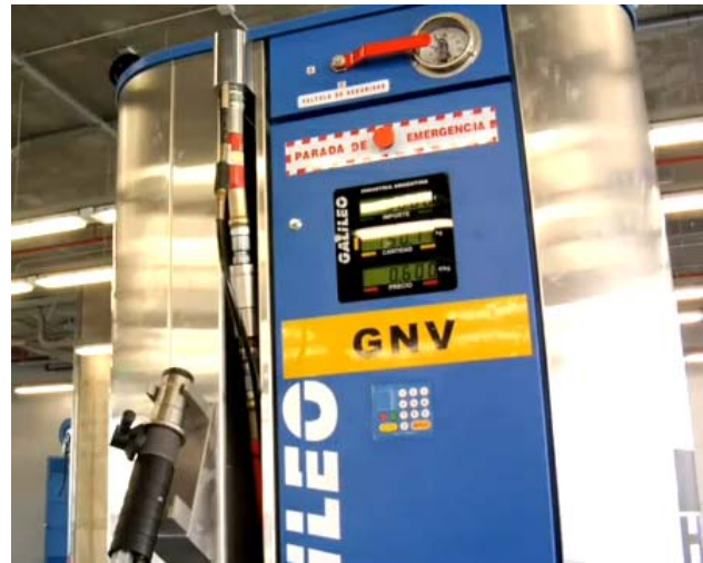
NGV Fuel Dispenser

Sanchinarro utilizes sophisticated mass-flow compressed natural gas fuel dispensers manufactured by GNC Galileo S.A., an Argentine company specializing in compressed natural gas and related technologies. The SNAP PAC system acts as a communications gateway or "message broker" to and from these dispensers. In this role, the SNAP PAC passes information in an ASCII format between the centralized EMT servers and the fuel dispenser server. The PAC also transmits real-time messages and data (such as individual transaction details and vehicle license plate numbers) so EMT can properly reconcile, validate, and bill anyone fueling at the station.