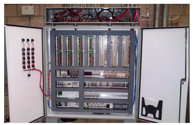
The OptoEMU Sensor and other SNAP PAC System hardware is wired to SUPERVALU's refrigeration system components and gathers consumption data that is then made available to both the company and curtailment service provider Net Peak

But monitoring is only one part of the energy-saving and cost-cutting equation. Once notified by Net Peak, SUPERVALU needs to quickly take action and begin curtailment, which means they need technology in place that will provide an automated response to curb power demand. Because the heaviest energy consumer in these facilities is the refrigeration equipment, systems integrator Advanced Energy Control (AEC) was brought in. AEC is an industrial controls company whose areas of expertise include refrigeration control, HVAC, and building