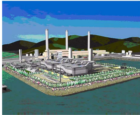
Artist's illustration of the Lamma Power Station