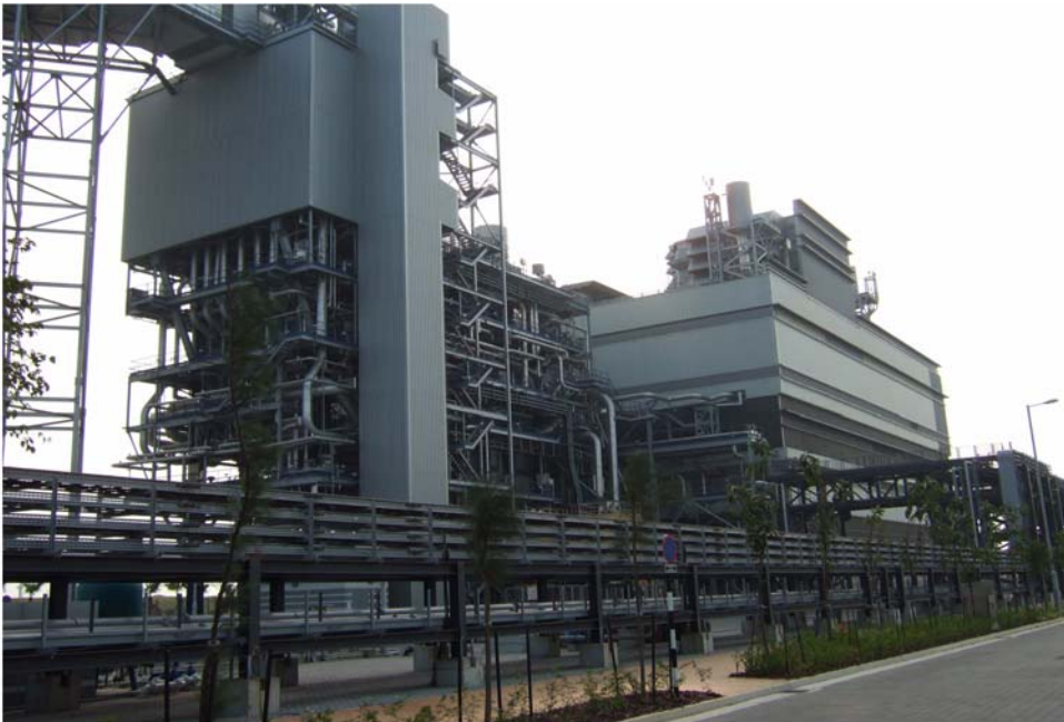
Lamma Power Station

The Lamma Power Station is located on Lamma Island, just a 30-minute ferry ride off the coast of Hong Kong. With its distinctive tall chimney stacks, the power station is visible from most of the surrounding islands. Hong Kong itself has close to 7 million residents and the Lamma Power Station uses complex transmission systems that include underwater pipelines to deliver energy for 40 percent of this population.